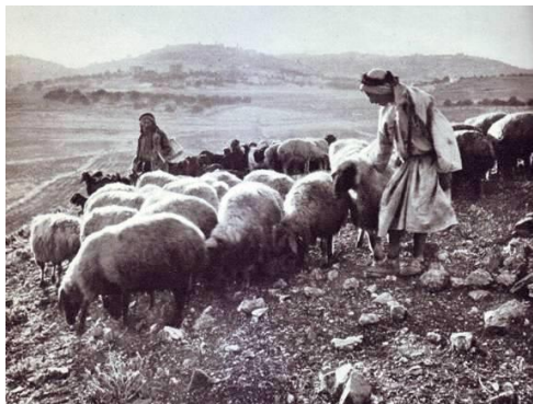
Fig. 5. Sheep and Shepherds in a field.

“Thank you. Yes, it carried Mary and our baggage a long distance for many days.” Joseph inquires, “May I ask you where your father is?”