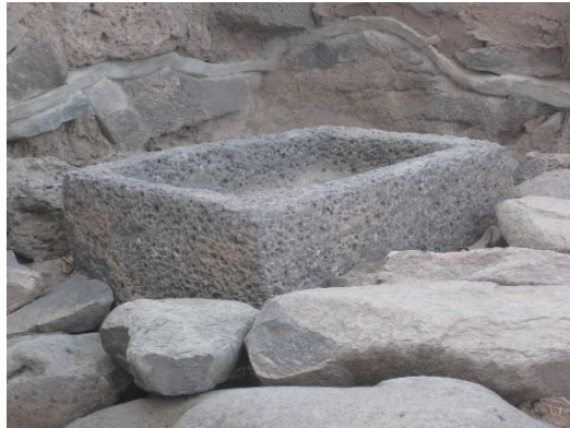
Fig. 4. Hewn Rock Manger.

Since I’m the Inn’s stable boy, I grab an armful of feed from the outside bin and throw it into the hewn rock manger in front of the ox. The rain shower this afternoon moistened the barley and grass feed which now smell just right. The ox starts eating it right away.