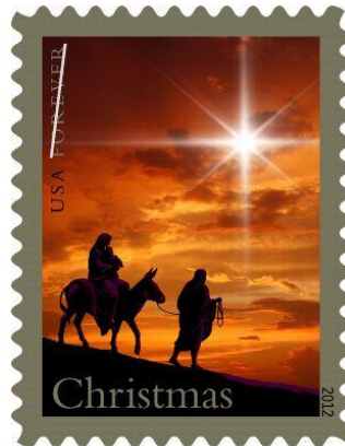
Fig. 6. Joseph leads Mary riding on a donkey.

Mary smiles at him with pride. He looks so happy while he works with his hands.