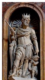
Fig. 3. Statue of King David.

Mom told me last month that the new Roman Census for taxes in Judea requires everyone to return to their home town to register. In our case the descendants of David need to return to Bethlehem, the city of David. So, the Inn and homes of the townspeople are crowded with relatives. Bethlehem doesn’t have room for so many out-of-town visitors.