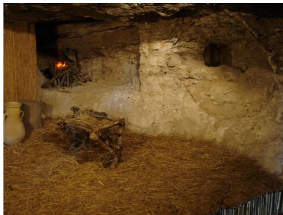
Fig. 1. A Stable Cave and wood manger in Bethlehem area.

Since I already swept the stable inside the cave and put on a layer of fresh straw, I wonder why Mom is calling me so urgently.