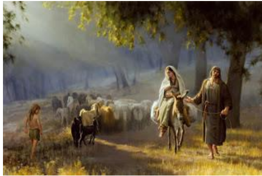
Fig. 2. Mary & Joseph travel to Bethlehem.